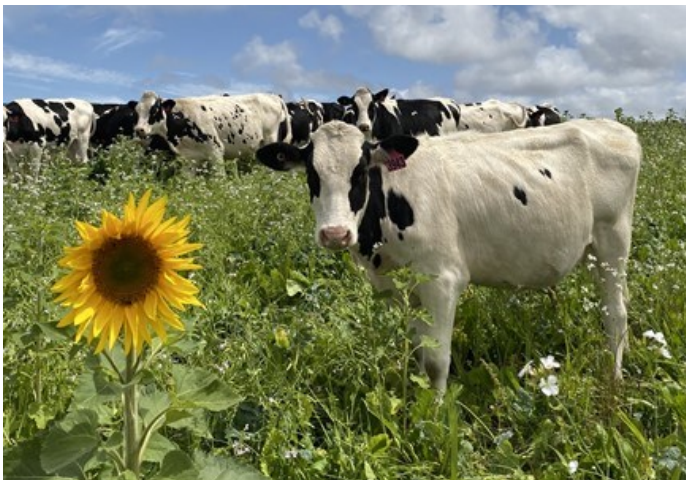
Sunflowers, grown as a cover crop at Gavin Sinclair's in Cooriemungle