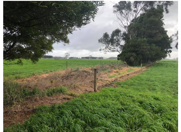
August 12th 2021

Do shelterbelts significantly improve pasture growth rates and productivity? We'll let the picture answer that question.